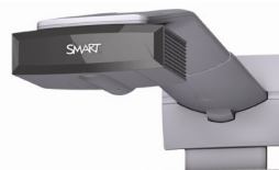
UniFi 55 Projector