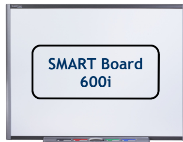
SMART Board 600i